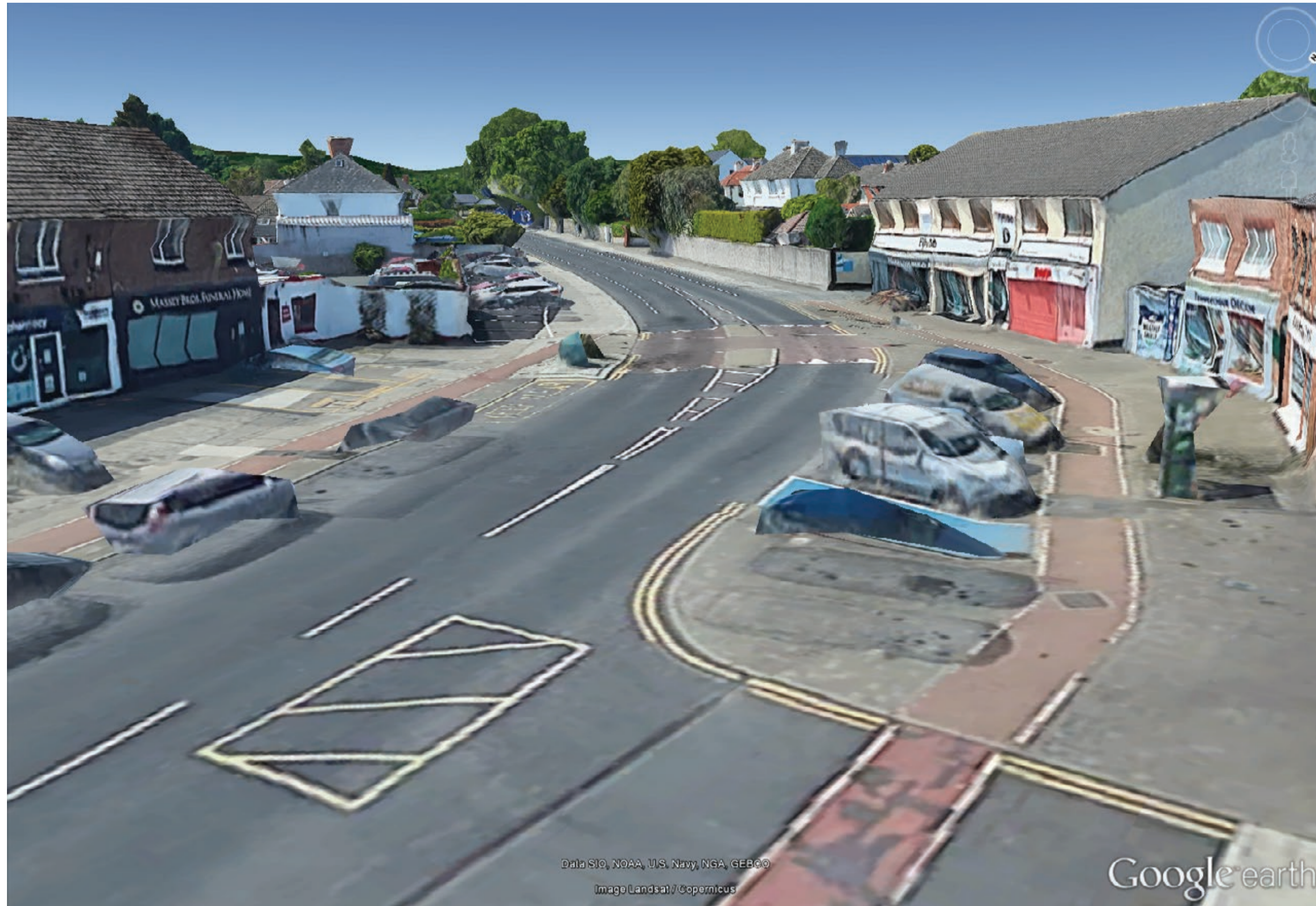
AS EXISTING LOOKING SOUTHWEST