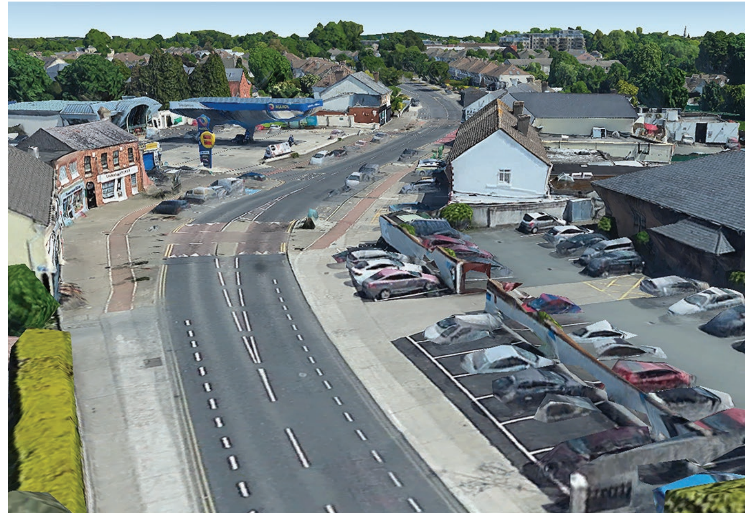
AS EXISTING LOOKING EAST ALONG TEMPLEOGUE ROAD