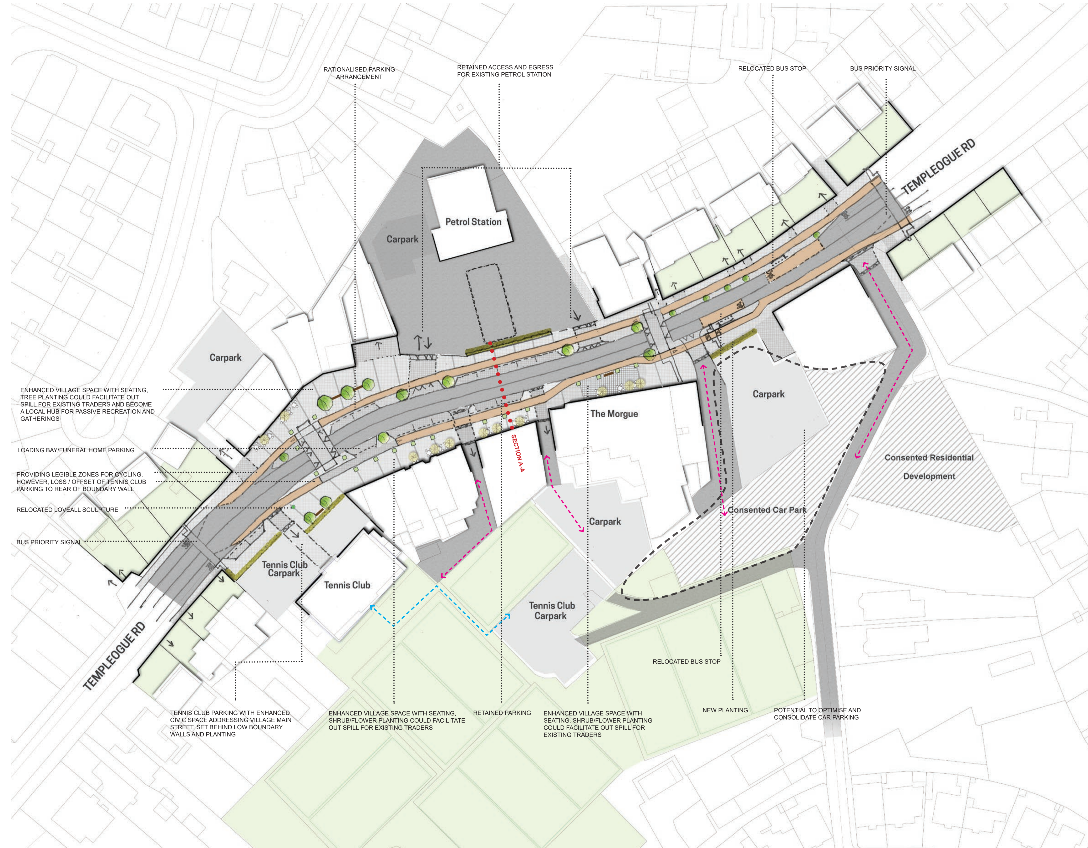
SECTION A-A: EXISTING 2 TRAFFIC LANES