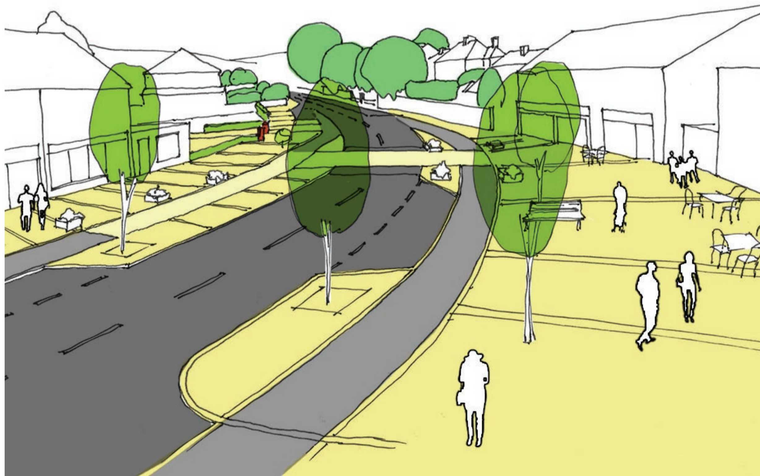
ILLUSTRATIVE ARTIST'S IMPRESSION LOOKING SOUTHWEST