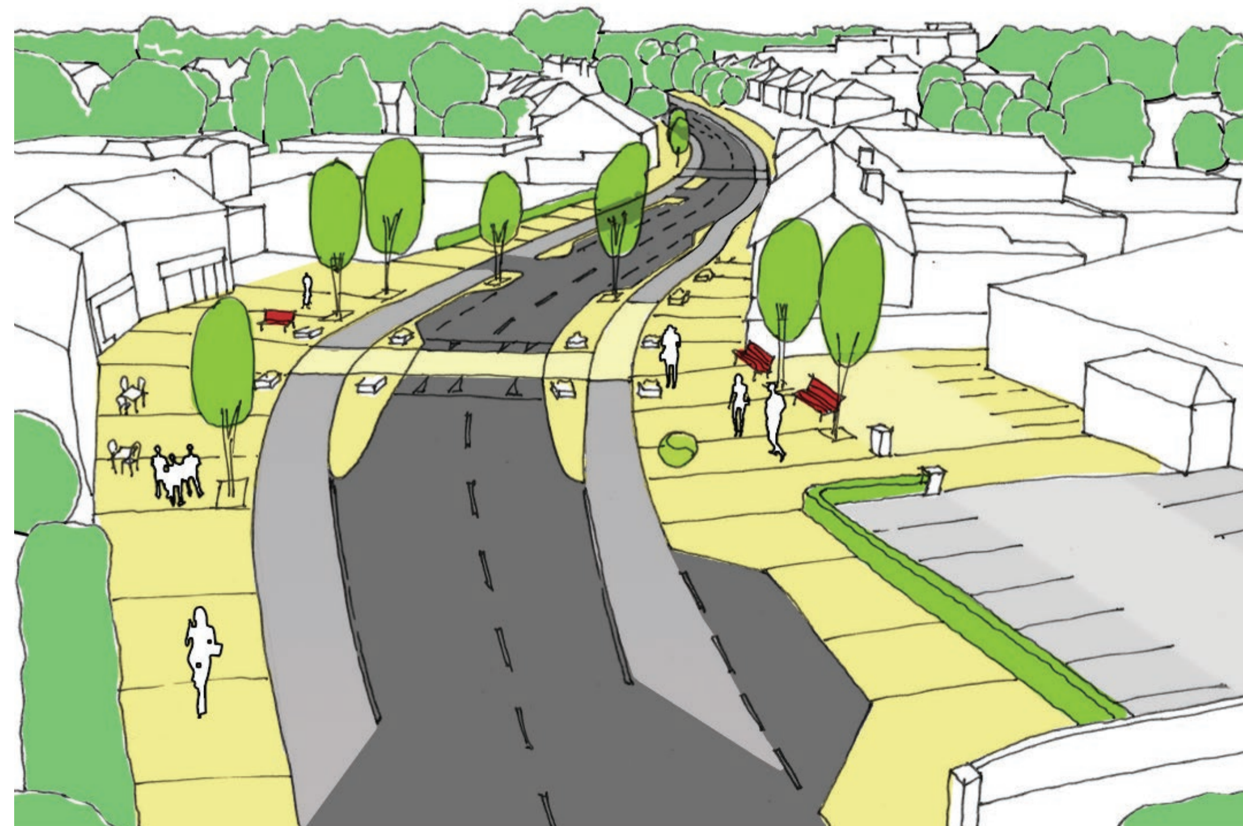
ILLUSTRATIVE ARTIST'S IMPRESSION LOOKING EAST ALONG TEMPLEOGUE ROAD